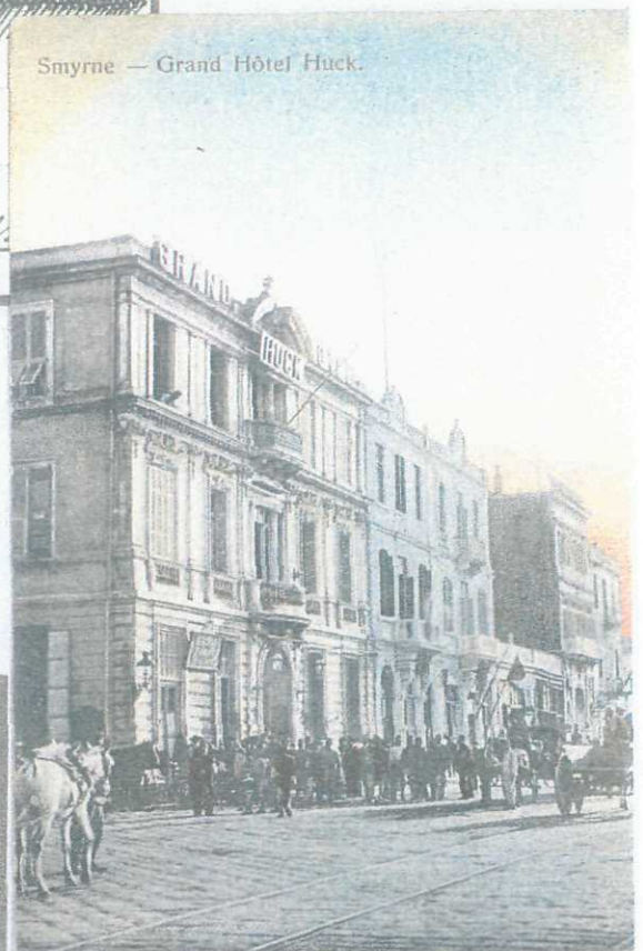
Smyrne — Grand Hôtel Huck.

A tour through all 7 post offices operating in Smyrna at that time, August 9, 1910, with a 10-para (or equivalent) stamp, each tied with the proper postmark. It would be a good guess to assume that this dedicated collector started his tour at the Ottoman Post located on the first floor of the Hotel Huck and finished at the British Post on the Rue Franque.